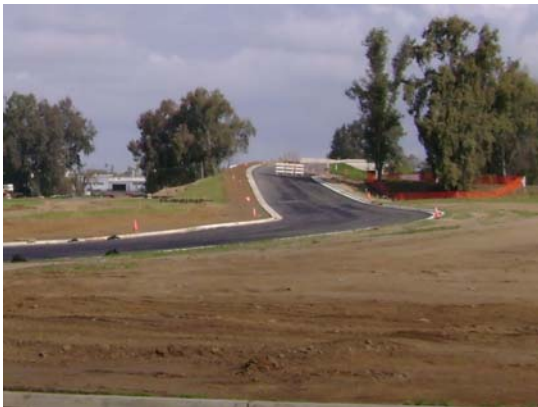
Looking north at a new section of Gateway Drive

Construction is now underway on a $6.4 million project to improve access to the Madera Community Hospital on Highway 99. Funded through a mixture of Measure "A" dollars and the State Transportation Improvement Program (STIP), this project will improve access from Madera Community Hospital to eastern Madera via Gateway Drive and establish a freeway offramp on the southbound side of State Route 99. An additional lane will be added to the Gateway Drive freeway overpass for northbound traffic, relieving pressure on the frequently congested Madera Avenue route. Construction began in November 2006 and is scheduled to be completed December 2008.