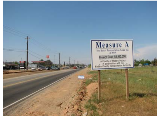
Construction zone northbound on Road 26

including a turn lane to divide the four travel lanes. Road 26 will improve from 2 to 3 lanes with a continuous center turn lane providing easier and safer access to businesses, homes and churches.