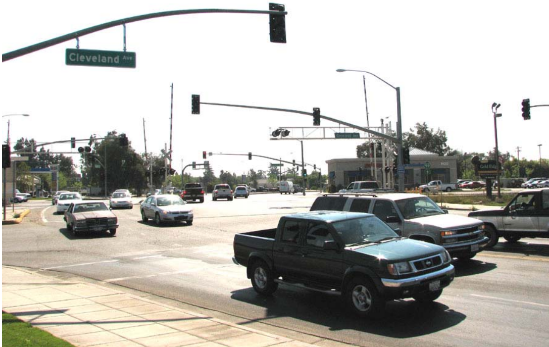
Traffic congestion and delay at the intersection of Cleveland Avenue and Gateway Drive will be alleviated by construction of the Ellis overcrossing.