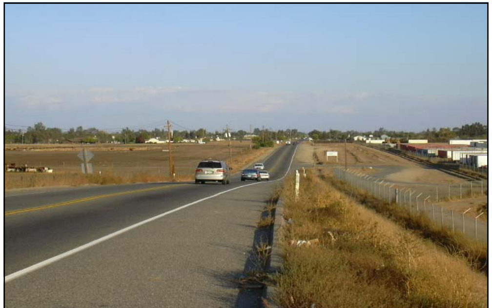
Road 26 and Avenue 17 are scheduled to be reconstructed, beginning in the Spring of 2004

The first phase includes the design, right-of-way, and utility relocation of an ultimate five-lane arterial and construction (Please see ROAD PROJECTS, page 3)