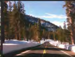
FHWA - Mammoth Scenic Loop - FHWA Central Federal Lands Highway Division