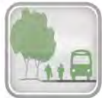
Complete Streets Design

Visit our table to learn more about our services