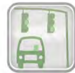
Transportation System Operations Analysis