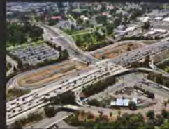
I-405 Sepulveda Pass Widening - Los Angeles County MTA

Auburn (530) 887-1494 Fresno (559) 438-8411 Modesto (209) 522-6273 West Sacramento (916) 375-8706 www.blackburnconsulting.com