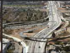
SR 22 Improvements - Orange County Transportation Authority