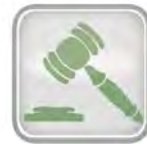
Transportation Policy Evaluation