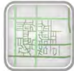
Travel Model Development