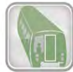
Transit Ridership Forecasting